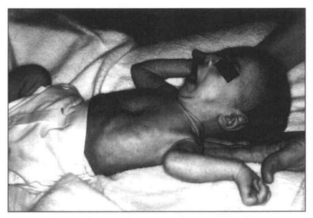
Fig 1. Infant with PRS demonstrating retrognathic mandible and respiratory distress.

conception, resulting in an unusually high tongue position within the nasopharynx. Concurrently, the lateral palatal shelves begin their medial growth toward the midline. However, the tongue is unable to descend due to lack of mandibular growth. The palatal shelves are obstructed by the tongue from moving toward the midline and fusing, thus creating a U-shaped palatal cleft. Generally it is believed that, after birth, an infant who is an obligate nose breather, experiences upper airway obstruction because of glossoptosis.<sup>5</sup>