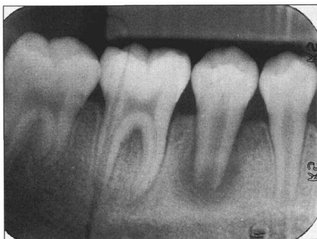
Fig 3. Diffuse radiolucency around the wide-open apex of #29 with no caries or restoration.

adjacent teeth responded normally. Periapical radiographs revealed no evidence of caries or restorations on #13, #20, and #29. A small, circumscribed radiolucency similar to a dental follicle was observed around the immature apex of #13. Widening of the periodontal ligament space on the mesial aspect of #13 also was observed (Fig 1). Diffuse radiolucencies were observed around the immature apices of #20 and #29 (Figs 2, 3). Teeth #20 and #29 were not tender to percussion. Careful examination revealed a small, round, flat surface about 1–1.5 mm in diameter between the buccal and lingual cusps on #13, #20, and #29 with a pin-point dark spot in the center of each flat surface (Fig 4). Abraded dens evaginatus was suspected at this time, and a tentative diagnosis of pulpal necrosis and exacerbation of chronic apical periodontitis was made for tooth #13. The diagnosis was confirmed by performing a test cavity into the pulp chamber without anesthesia revealing a necrotic pulp chamber. The canal was debrided with endodontic files, dried and packed with \text{Ca}(\text{OH})_2 powder, and temporized with IRM® (Dentsply International, Inc., Milford, DE) The mother was informed that an apexification procedure would be necessary to induce root end closure.