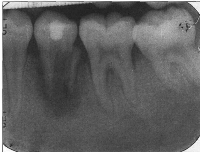
Fig 5b. Root fracture of #20 with diffuse radiolucency around the root.

Recognizing this anomaly usually is not a problem when the affected tooth has just erupted while not in occlusion. Parents or guardians should be informed about potential complications of this anomaly. It would be appropriate to observe the eruption of the affected teeth closely, and once it is determined that the anomalous cusp is going to be in the path of occlusion, remove the structure. If there is pulp exposure, a direct pulp capping should be performed and appropriate restoration placed.