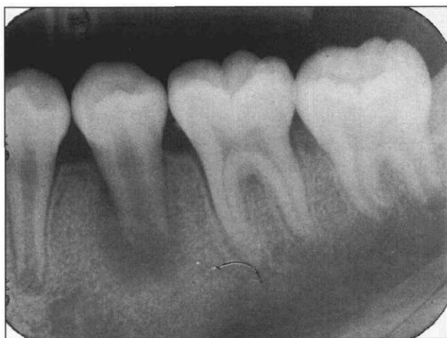
Fig 2. Diffuse radiolucency around the wide open apex of #20 with no caries or restoration.