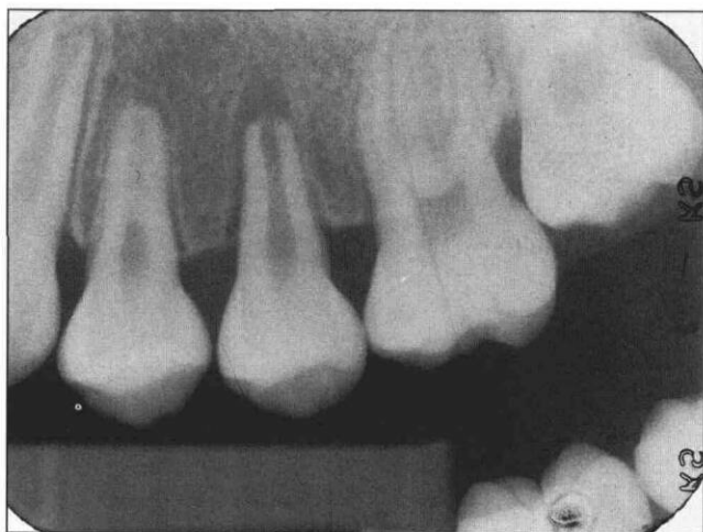
Fig 1. Periapical radiograph of tooth #13 showing immature apex with small radiolucency similar to dental follicle. Thickening of the periodontal ligament space on the mesial side of the tooth is also apparent. No caries or restoration observed on #13.