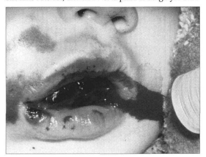
Fig 2. Extensive intraoral coagulum prior to operating room procedure.

modation and the extraocular muscles were intact. Cranial nerves II through XII were grossly intact. Intraorally, the buccal mucosa appeared lacerated with a significant intraoral coagulum preventing adequate examination, identification, or opportunity for local treatment of the bleeding point(s) (Fig 2). Physical assessment of heart, lungs, and abdomen were within normal limits. Vital signs included: pulse, 114-135; respiration, 24-26; and blood pressure, 112/58 mm/Hg. Due to continued bleeding, the airway was becoming compromised and the patient's systemic status was declining rapidly. The decision was made to place the patient under general anesthesia in order to remove the coagulum, identify and locally manage the bleeding site, and to secure an airway. A CBC with differential, PT, PTT, platelet count and factor assay were ordered. Abnormal laboratory values included: hemoglobin 5.9 gm/dl, hematocrit 17.1%, partial prothrombin time 73.6 sec, and MCV 87.4 prior to surgery. Factor