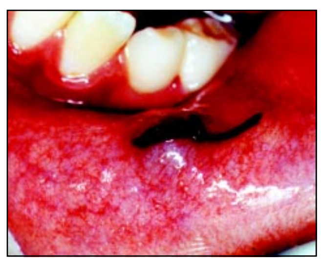
Fig 5. Follow-up of 7 days.