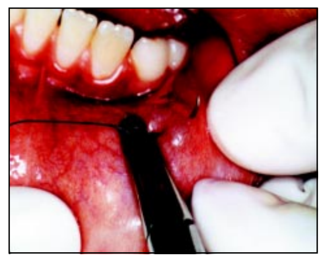
Fig 3. Passage of a 4.0 silk suture through the internal part of the lesion.