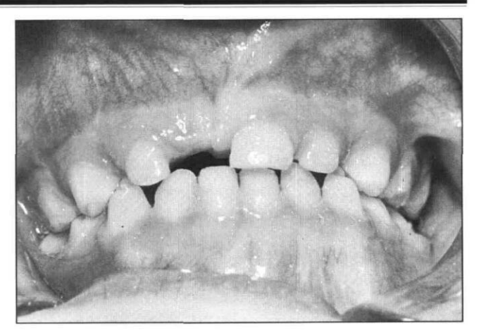
Fig 1. Neonatal line on mandibular primary incisors.