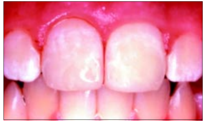
Fig 10. Incisors with interim restorations shown immediately after splint removal

after applying phosphoric acid to etch the enamel, the etched surface is rinsed and dried. Oftentimes, when splinting teeth after traumatic displacement, there exists hemorrhage in the region which, once controlled, can resume with water spray lavage of the etchant solution. In addition, water spray and the sound of high-speed evacuation can be upsetting for some younger patients. Use of self-etching adhesive bonding agent makes splint application easier and faster by eliminating the separate etching and rinsing steps.