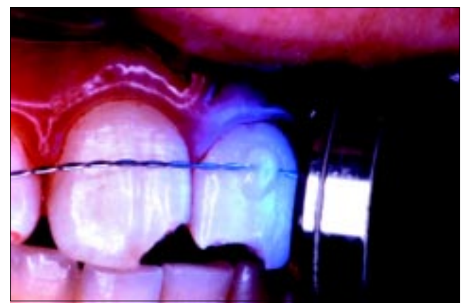
Fig 3. Small increment of compomer material attaches twisted double strand of 0.010" ligature wire to tooth surface at about one-third coronal height