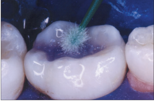
Figure 7. Clear sealant is applied after 15 second-application of the self-etching adhesive solution.