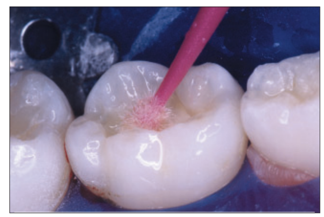
Figure 3. The self-etching adhesive bonding agent is applied after the enamel is roughened with a round diamond bur.<sup>4</sup>

resin formulations will vary. In primary teeth with caries lesions in stress-bearing regions, the authors have used MagicFil only for children whose treated teeth are expected to exfoliate within 3 to 5 years.