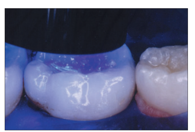
Figure 5. The initial light beam is applied.