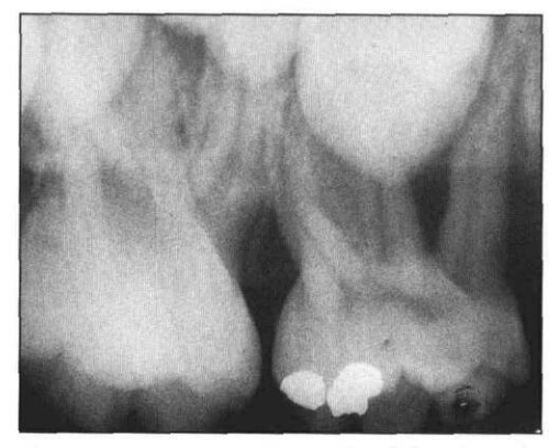
Fig 2. Periapical radiograph of fused teeth depicting single pulp chamber, four roots, and bony resorption of the mesial root.