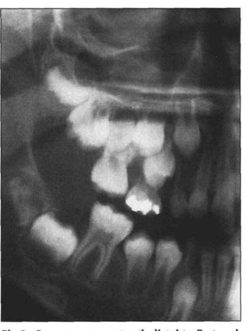
Fig 3. Supernumerary tooth distal to first and second bicuspids and apical to first permanent molar. Note root resorption of fused tooth.

In the present case, there was no significant medical condition, history of any orofacial trauma, or recollection of serious dental problems in other family members. Therefore, no clear etiology is evident. In general