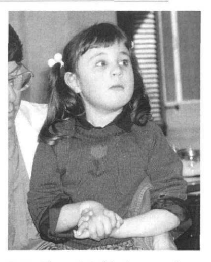
Fig 6. The autistic-like features of Rett syndrome with stereotypic hand washing and hand clasping.

This case illustrates the multidisciplinary medical findings for a 4year, 3-month-old white female diagnosed as having Rett syndrome. The patient fulfills all diagnostic criteria of Rett syndrome as defined by Hagberg (1985) in Table 1. There seems to be a profound degeneration of early behavioral, social and psychomotor achievements, evolving communication dysfunction, dementia, loss of acquired purposeful