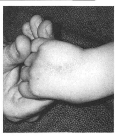
Fig 2. Hyperkeratotic area on dorsum of hand due to stereotypic handwashing.

Intraoral examination of the oropharynx, tongue, floor of the mouth, buccal mucosa, frena, gingiva, and periodontium were within normal limits. Palatal shelving was present (Fig 3).