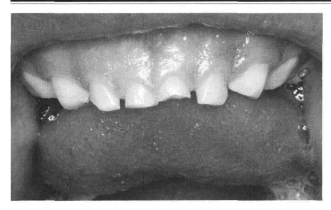
FIG 4. Severe attrition of the mandibular primary anterior teeth due to bruxism.