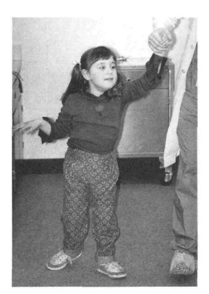
FIG 1. A pose of the stereotypic clumsy gait seen in Rett syndrome.

The most recent evaluation was done at Riley Child Developmental Center in Indianapolis, Indiana, when the child's chronological age was 4 years, 3 months. The physical examination showed the patient's height and weight to be in the 75th percentile (National Center for Health Statistics). Positive clinical findings included hyperventilation, stereotypic hand washing activity, autistic-like features, mild to moderate generalized