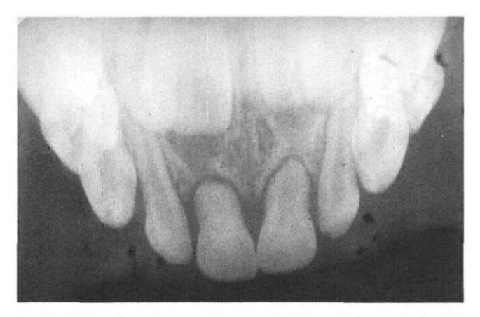
FIG 5. External root resorption, a widening of the periodontal ligament, and signs of calcific metamorphosis of the maxillary primary central incisors.

dental development was normal for a 4 year old. The maxillary primary central incisors exhibited external root resorption, a widened periodontal ligament, and signs of calcific metamorphosis (Fig 5).