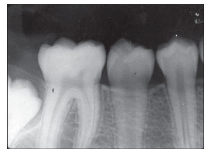
Fig 4. Periodic control radiograph taken after 2 years and 10 months showing the tooth in the oral cavity.

genesis of the second premolar. After one-year follow-up, the second premolar presented normal root development upon periapical radiographic examination. Radiographic follow-up was again performed after two years and ten months (Fig 4).