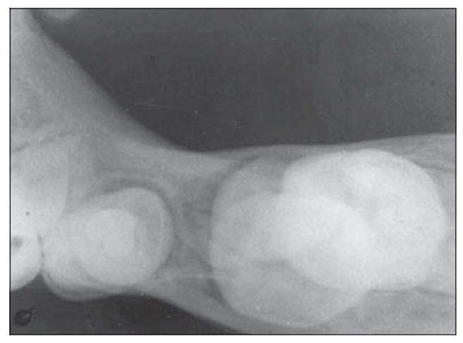
Fig 2. Occlusal radiograph of the right mandibular hemi-arch region. The second premolar is located lingually to the second primary molar causing a small bulging of the cortical bone in the lingual region.

crown of the primary tooth, may eventually continue its normal formation following the superior position of the crown of the ankylosed primary mandibular molar.<sup>1, 5-7</sup>