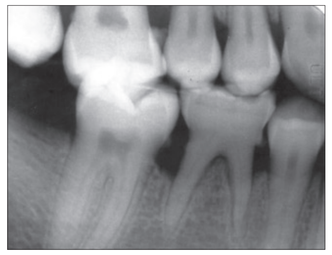
Figure 5. Obliteration of primary mandibular right second molar and alveolar bone loss in a 21-year-old transplanted patient.

Nevertheless, there are also complications of RTx, including: