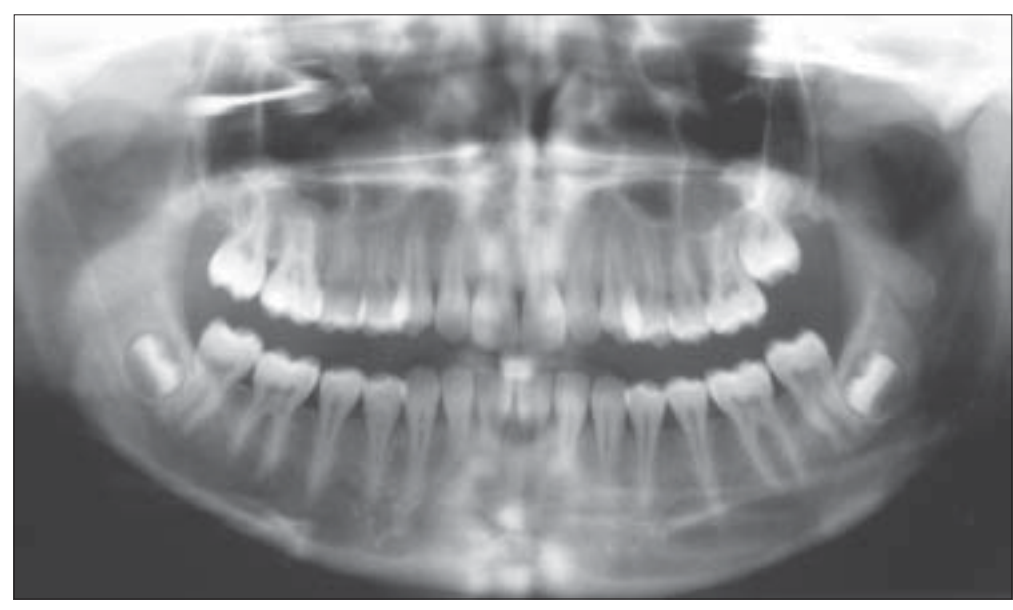
Figure 3. Orthopantogram; note the long spindly tapered roots, pulp stones, and absent maxillary third molars.