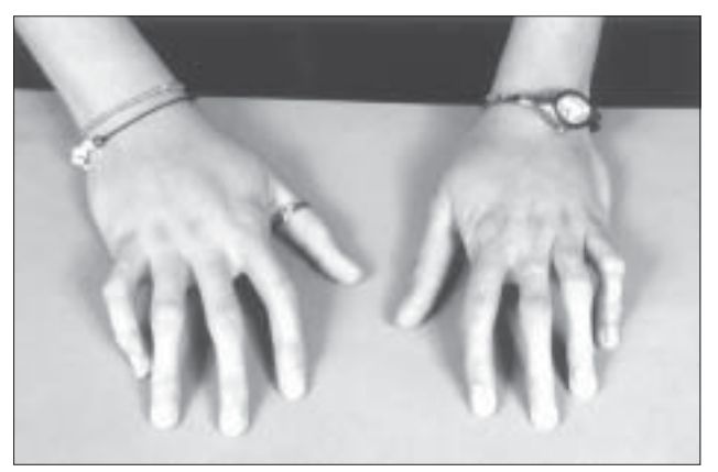
Figure 1. Photograph of the patient's hands showing fixed flexion deformity of the fingers.

The differential diagnosis of CCA includes: Marfan's syndrome, homocystinuria, arthrogryposis, Achard's syndrome, osteogenesis imperfecta, and Stickler's syndrome. The most important differential diagnosis to be excluded is Marfan's syndrome. The conditions overlap in symptomology and morphology but differ dramatically in prognosis (Table 1). Both have an autosomal dominant inheritance pattern with variable expression. The features include tall, slender body, frequent kyphoscoliosis, and normal intelligence. Arachnodactyly and dolichostenomelia are usually more frequent and severe in Marfan's syndrome, and hyperextensibliity of joints is more usual. Ocular defects and cardiovascular abnormalities are also common.