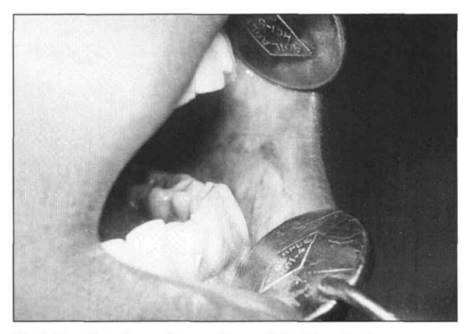
Fig 1. Restricted mouth opening and the blanched appearance of buccal mucosa.

The interincisal distance of maximal mouth opening was 1.7 cm. The oral mucosa appeared very pale. On