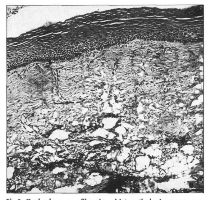
Fig 3. Oral submucous fibrosis — histopathologic appearance of buccal mucosa showing atrophic epithelium and hyalinized lamina propria — H&E stain (original magnification, 100x).

The role of areca nut as an etiologic factor in OSMF has gained attention during recent years. <sup>19, 25</sup> The frequency of areca nut chewing habit reported ranges from 84 to 100% in OSMF cases. <sup>17, 18</sup> Sinor et al., <sup>18</sup> in a case control study, demonstrated that this condition occurred only among those who chewed areca nuts in one form or other.