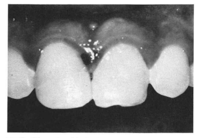
FIG 3. The restored incisors.

to all treated surfaces and the parts were approximated by hand to the original position.