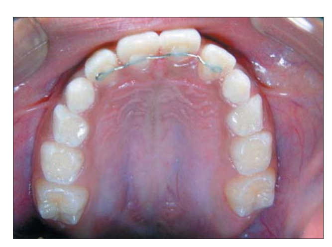
Figure 10. Maxillary bonded fixed retainer extending across the left to right lateral incisors and bonded to all 4 incisors for better stabilization.