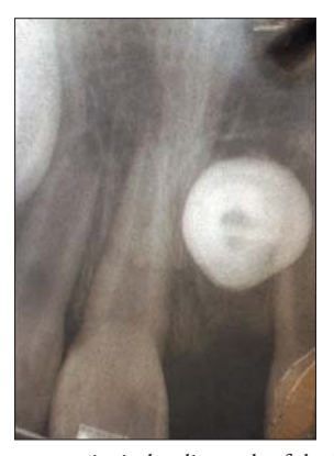
Figure 3b. Pretreatment periapical radiograph of the impacted left central incisor.