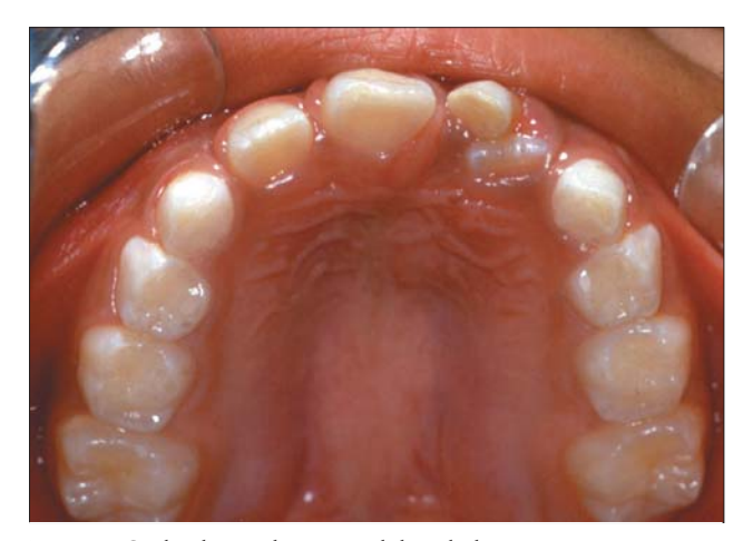
Figure 2. Occlusal view showing arch length discrepancy.

Surgical exposure of the left central incisor was achieved using strict subperiosteal elevation of a mucoperiosteal flap, and careful removal of the buccal cortical bone was achieved using a diamond bur (Figure 5). The impacted tooth was found to be in an inverted position rather than horizon-