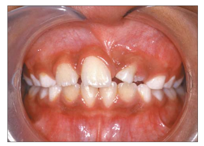
Figure 1. Frontal view showing the missing left permanent central incisor, with ectopic eruption of the left primary lateral incisor.