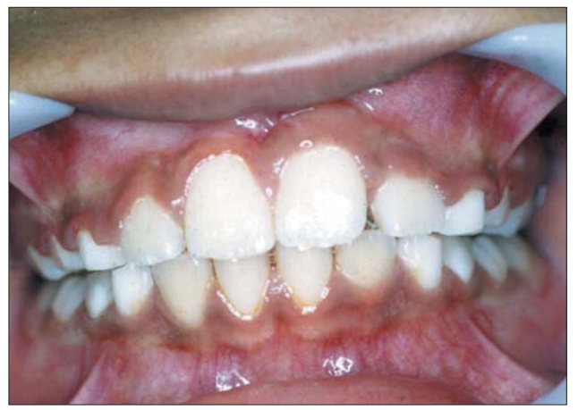
Figure 11. One year postsurgery, observe the acceptable gingival contour. Marginal gingiva envelops the central incisors in a collar–like fashion with a good outline on the buccal surface.