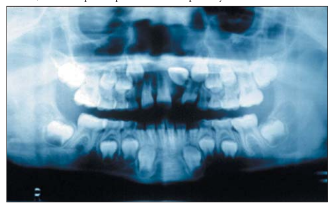
Figure 3a. Pretreatment panoramic radiograph. Notice the apparent horizontally positioned left central incisor relative to the occlusal plane.