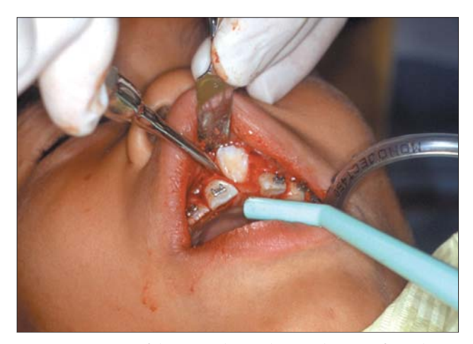
Figure 6. Luxation of the inverted central incisor being performed.

elastomeric power chain between the helix of a 0.016×0.016-inch stainless steel wire was used to apply a light force of 30 to 40 g.