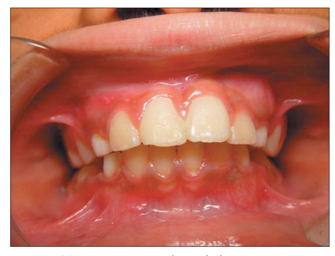
Figure 12. Two years postsurgery, the attached gingivae are demarcated from the adjacent alveolar mucosa on the buccal surface by a well-defined mucogingival line. The color, size, and shape are acceptable. The left central incisor was vital with no change in color noticed. Vitality tests were normal.