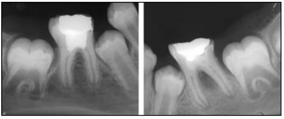
Figure 3. The same teeth 12 months postoperatively. Notice continued normal root development in both teeth.