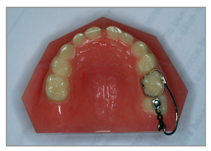
Figure 1. Halterman appliance.

some modifications and clinical tips are offered to enhance clinical success.