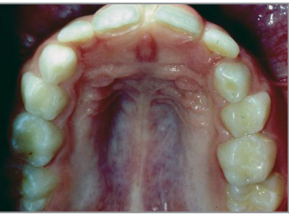
Figure 3. Occlusal view shows impaction of the permanent maxillary left first molar (tooth #14)