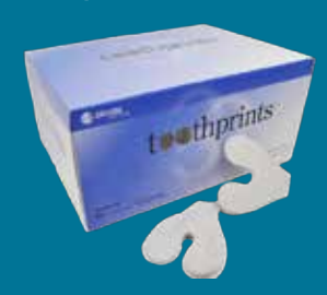
Parent Peace of Mind