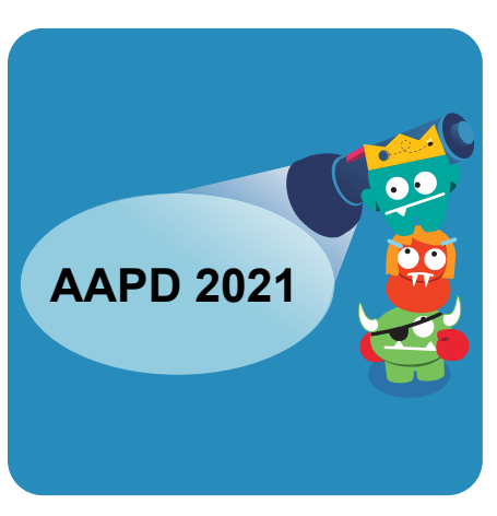
Advance Registration Special Edition

The PDT magazine (ISSN 1046-2791) is published bimonthly by the American Academy of Pediatric Dentistry, 211 E. Chicago Avenue—Suite 1600, Chicago, Ill. 60611, USA, (312) 337-2169. Periodical Postage Paid at Chicago, Ill. and at additional mailing offices. POSTMASTER: Send address changes to PDT, 211 E. Chicago Avenue—Suite 1600, Chicago, Ill. 60611, USA.