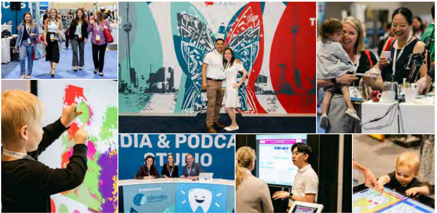
Exhibit Hall & Poster Competition

The Exhibit Hall in Toronto was bustling as the homebase for the D4C Activation Station, Elevate Oral Care Headshot Lounge, and Sprig Walking Challenge. Attendees enjoyed insightful presentations and product demos in the Sponsor Theater, live recordings in the Media Hub, and a fierce annual Poster Competition with 400 residents presenting their research.