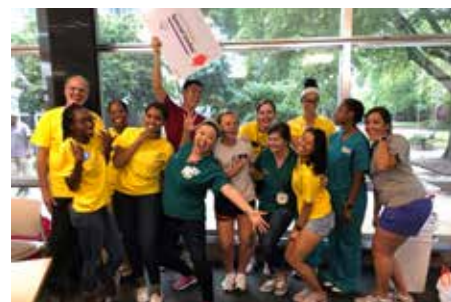
Members participated in Special Olympics event in Raleigh, NC providing screenings, OHI, and fabricating mouthguards.