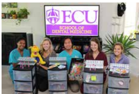
The Executive Board created four new toothbrushing carts for the addition of new classrooms at ECU Community School this year.

ECU SAAPD has an active agenda of community involvement projects focused on improving oral health literacy and developing positive oral health habits for children. In addition, members will engage in "lunch and learn" events on topics such as maternal and infant nutrition, prenatal/baby oral health, pediatric dentistry residencies and collaborations between pediatricians and pediatric dentistry. Several student members are currently working to expand the Prenatal Oral Health Program developed by UNC School of Dentistry and implemented here at Ross Hall, to a CSLC with the intent to expand to all. Our student chapter values the importance of pediatric oral health and is committed to working with all aspects of health to provide holistic care for our children.