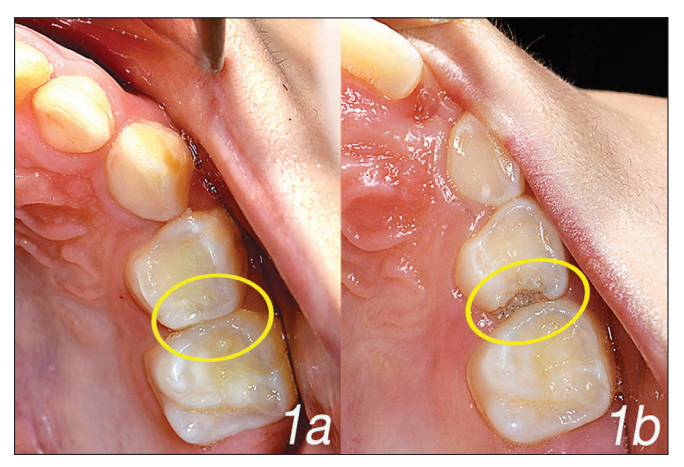
Figure 1. "I" or straight type of contact between the primary maxillary left molars at (a) baseline and (b) after 19 months.

Caries prevalence period determination. The mean time (days) between the initial and first follow-up examinations of the children with caries-affected contacts was 722 days (±285.5 SD, approximately 24 months). The shortest duration observed for caries to occur was 365 days (12 months),