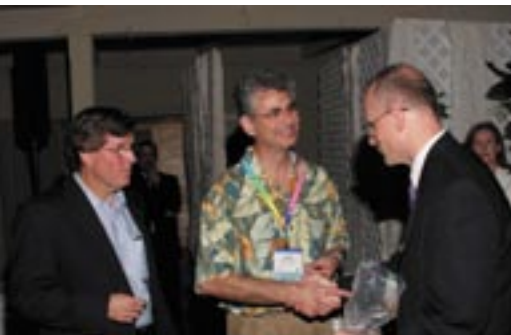
Heritage Circle donors who gave to the Baylor Pediatric Dentistry Alumni Fund receive pins.

The Donor Circle Reception, held Thursday, May 24th, was enjoyed by donors, corporate sponsors, board members and guests. The annual event recognizes the generosity of those who join Healthy Smiles, Healthy Children's highest giving levels to support the Foundation's activities. The event highlighted Healthy Smiles, Healthy Children's professional and public educational programs, the annual research awards for graduate students and pediatric dentists, and public awareness activities. The reception also honored the Legacy, President's and Heritage Circle Donors with a new lapel pin during a pinning ceremony.