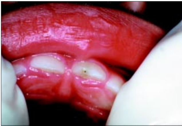
Fig 3. Occlusal view shows dark pin point "catch."