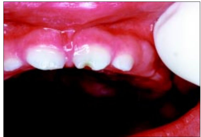
Fig 2. Anterior view of the erupting maxillary incisors. Note depression of mid-incisal edge of left central incisor.