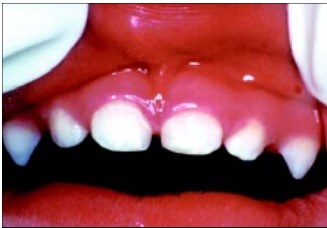
Fig 5. Nine months following treatment. Note erupting canines.

habits included a feeding bottle and thumb-sucking. The patient's maxillary left central incisor showed a depression on the mid incisal edge (Fig 2), which included a pin point black "catch" (Fig 3). An explorer was unable to penetrate more than a quarter of a millimeter. The child was placed in a Papoose board™ (Olympic Medical, Seattle, WA) with auxiliary head restraint, and a periapical radiograph was taken. The radiograph