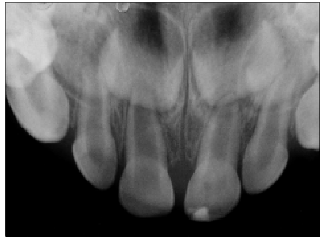
Fig 6. Periapical radiograph at recall exam. Note: Root development has continued to progress. The apex is closing and the root walls have thickened.

habits included a feeding bottle and thumb-sucking. The patient's maxillary left central incisor showed a depression on the mid incisal edge (Fig 2), which included a pin point black "catch" (Fig 3). An explorer was unable to penetrate more than a quarter of a millimeter. The child was placed in a Papoose board™ (Olympic Medical, Seattle, WA) with auxiliary head restraint, and a periapical radiograph was taken. The radiograph