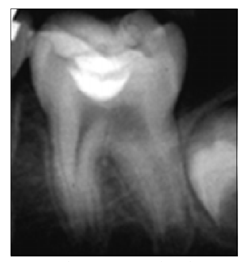
Fig 3. Immediate post-operative radiograph: MTA, Cotton pellet, Photocore Temporary placed.

The patient should return one week later for final restoration. At this time, the temporary and cotton pellet should be removed and vitality reassessed. Test for adequate setting of MTA using a spoon to carve around the edges of the material and remove residual cotton fibers, which frequently adhere to the set MTA. The instrument should be kept as far as possible from any previous exposure sites. The MTA should be the same