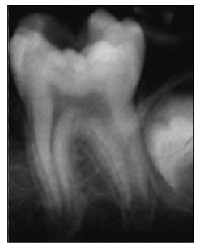
Fig 2. Pre-operative radiograph of a 7 yearold with a carious tooth #19 with open apecies.

teoblasts were studied in vitro and it was found that MTA stimulated the release cytokines and of the production of interleukin.<sup>20,24,25</sup> The material has also been show to have antimicrobial properties similar to that of amalgam, ZOE, and SuperEBA.26 MTA has been found to have low cytotoxicity when compared with IRM and Super EBA.<sup>6,14,27</sup>