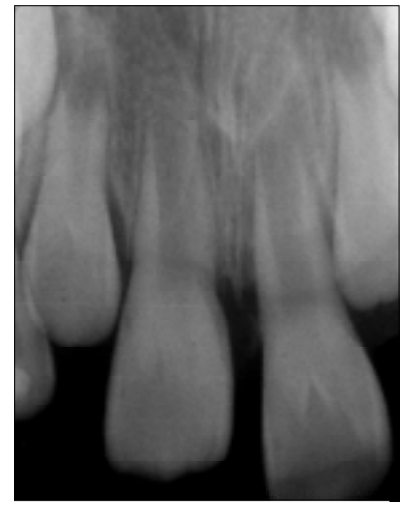
Fig 8. Replantation of tooth left central incisor, 2 hours post-complete avulsion.