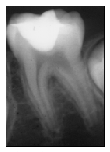
hardness and consistency of a set concrete. Once proper setting of MTA has been ascertained, the tooth can be restored with bonded composite or another restoration of the clinician's choice. The final restoration should be bonded or placed directly over the set MTA.

The patient should be checked at six months via radiographs and cold test to monitor vitality (Fig 4).