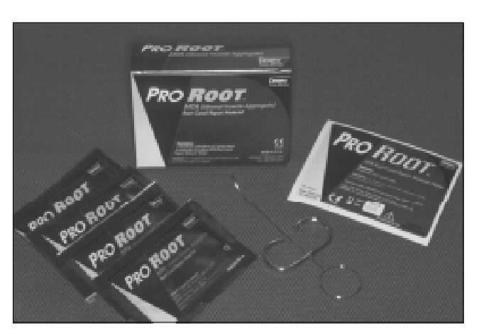
Fig 1. ProRoot<sup>TM</sup> MTA and delivery instruments

When pulp exposures are encountered, sodium hypochlorite has been shown to be an effective agent for disinfection, dentinal chip removal, and hemostasis. The most crucial area of concern is the inability to achieve a perfect seal to prevent marginal leakage of the medicament covering the pulp and or the final restoration. While bonding systems and composite resins have greatly improved sealability in recent years, there is clear evidence that, even with the best bonding system, there is microleakage of bacteria around the restoration. Therefore, it is imperative that the materials used to protect the pulp have an enhanced seal to compensate for potential marginal leakage of the restoration.