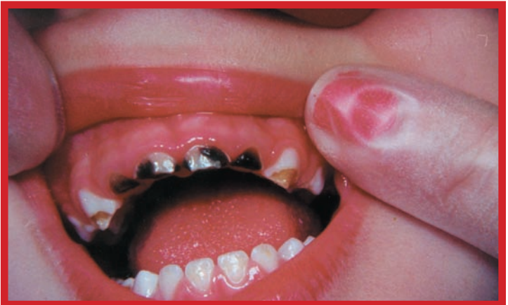
2-year old, Early Childhood Caries, 12 decayed teeth, trouble eating, severe pain