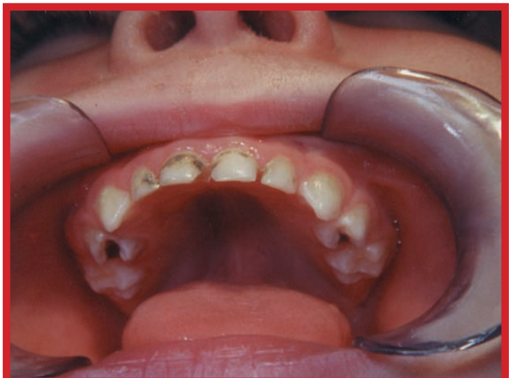
2-year old, Early Childhood Caries, 16 decayed teeth, severe pain