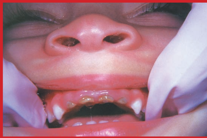
20-month old, Early Childhood Caries, severe pain