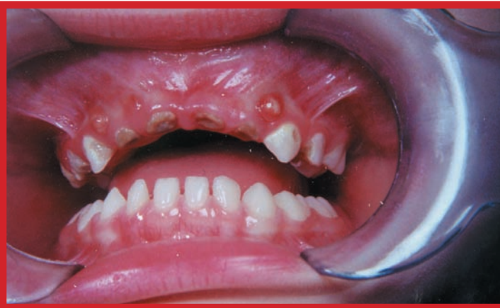
28-month old, Early Childhood Caries, severe pain