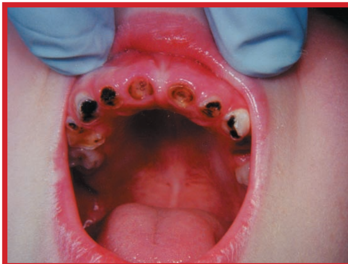
2-year old, Early Childhood Caries, 16 decayed teeth, 8 teeth need to be removed, trouble eating, low weight for age, severe pain