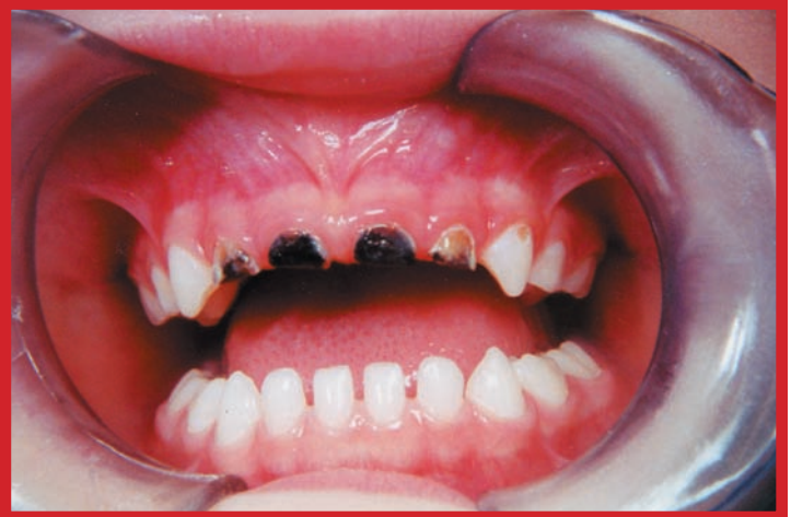
20-month old, Early Childhood Caries, 9 decayed teeth, trouble eating, low weight for age, severe pain