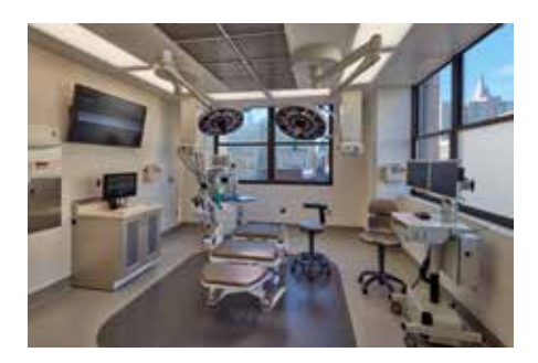
NYU Dentistry's Oral Health Center for People with Disabilities has two fully equipped sedation suites to provide both inhaled and intravenous sedation administered under the supervision of anesthesiologists, eliminating the need for most patients to be referred to hospitals.

patients can be treated by specially trained NYU Dentistry faculty at one of our hospital affiliates—NYU Langone Health or Bellevue Hospital Center—but remain patients of record at the NYU College of Dentistry."