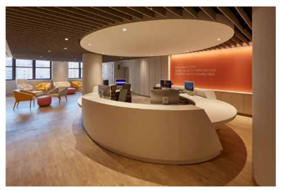
NYU College of Dentistry's Oral Health Center for People with Disabilities provides comprehensive dental care for patients whose disabilities or medical conditions prevent them from receiving care in a conventional dental setting

People with disabilities face many barriers to receiving dental care, including physically accessing dentists' offices, which may not be able to accommodate wheelchairs or other assistive devices. In addition, some dentists lack confidence in their ability to meet the needs of people with disabilities, so may not be prepared or willing to welcome disabled patients.