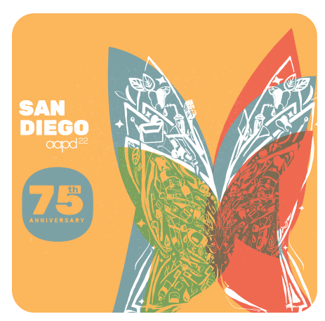
Advance Registration Special Edition

The PDT magazine (ISSN 1046-2791) is published bimonthly by the American Academy of Pediatric Dentistry, 211 E. Chicago Avenue—Suite 1600, Chicago, Ill. 60611, USA, (312) 337-2169. Periodical Postage Paid at Chicago, Ill. and at additional mailing offices. POSTMASTER: Send address changes to PDT, 211 E. Chicago Avenue—Suite 1600, Chicago, Ill. 60611, LICA