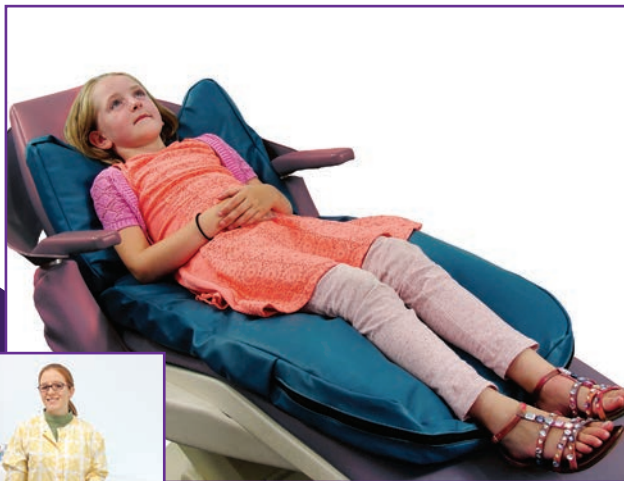
The chair cushions have Roll-N-Store Straps for easy carrying and storage.